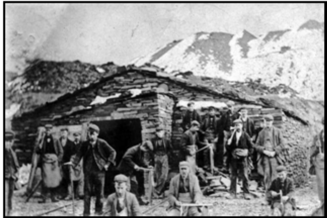
Workers at Burlington Slate Quarries circa 1904

for Soutergate for the period 1841-1881, it is possible to trace some of the changing patterns of employment over that time. Despite the tradition of farming in the village, in 1841, more men described themselves as 'Slate River' than 'Agricultural Labourer'. However, when the farmers themselves are included, the total number employed in agriculture was twenty-nine and slate quarrying, twenty-eight.