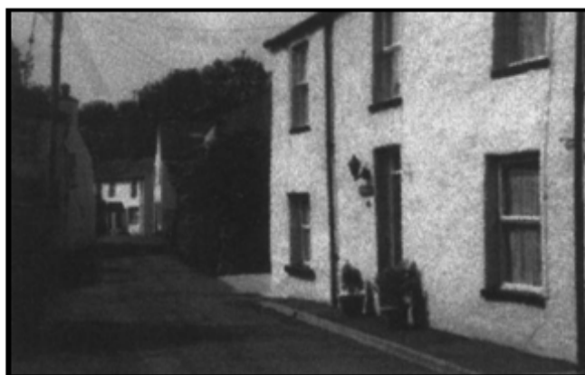
"SUN INN" Soutergate