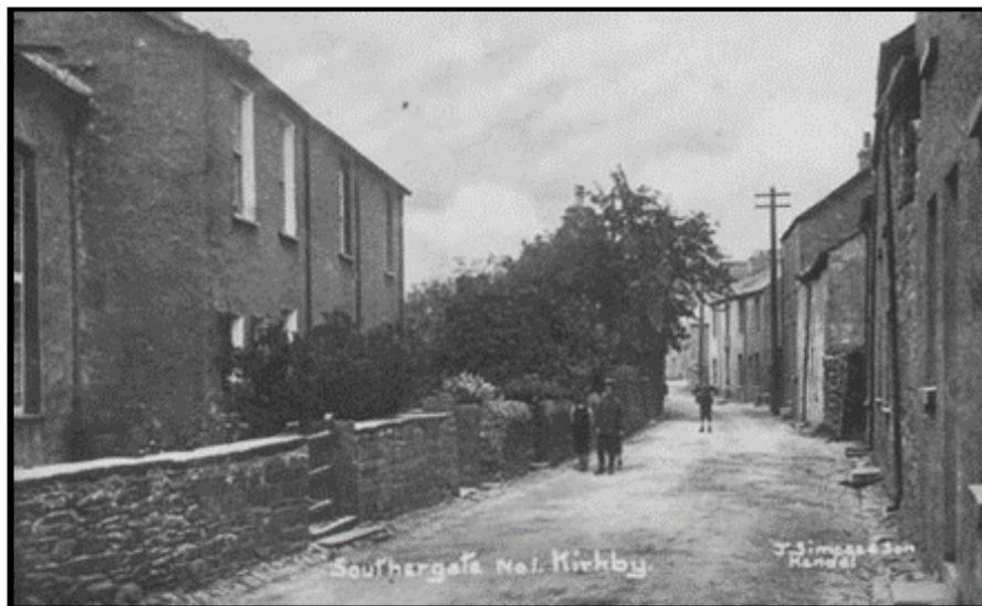
Road through Soutergate with the smithy and "Sun Inn" on the right

Although the A595 road now runs along the back of the Hamlet, it used to go through Soutergate and wind back past "Soutergate House". This is within living memory and at least one person can remember the 'Fair' making its way through. The 'new' piece of road is still referred to as the 'back road' by many local people.