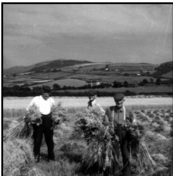
Harvesting in fields adjacent to Soutergate 1970's

A change came in 1861 when iron ore miners were first shown in the Returns, but still the largest number of men were employed in slate. An 'Engine Driver' is shown in this census and two 'Railway Labourers' appeared in 1851, shortly after the Furness Railway was established.