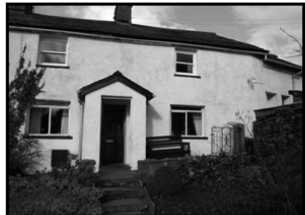
The pictures show the house before renovation in the 1980s and today.