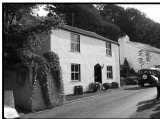
2005 The Old Co-operative Store