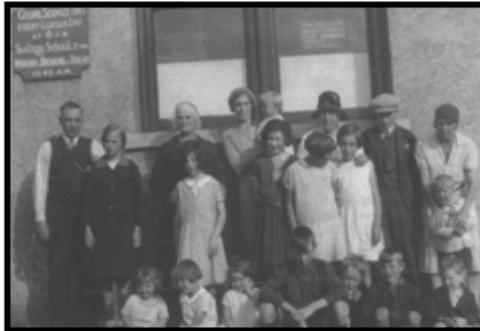
'Sunshine Corner' circa 1934 -1935

Over the years there has been a regular Sunday Service. There used be a Children's Meeting on a Monday night and this was attended by between forty and fifty children from the Village. Choruses were sung, lantern slides were shown, Bible stories were told and there were Bible quizzes. An annual party was held followed by prize giving. Every child was given a book.