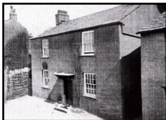
1862 The Old Co-operative Store